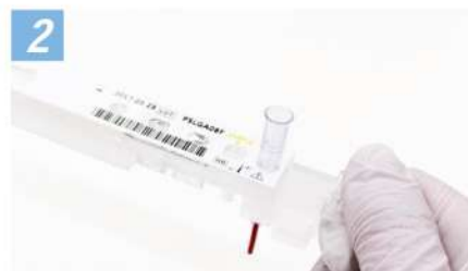
Step 2: Place the C-tip™