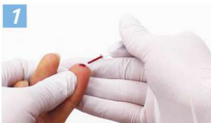
Step 1: Collect blood